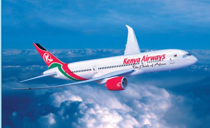
What are the MRO Strategies in Africa for New-Technology Aircraft such as the Boeing 787 (above) and the Airbus A350 (below)?