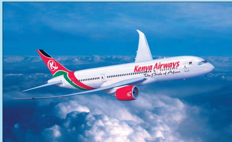
What are the MRO Strategies in Africa for New-Technology Aircraft such as the Boeing 787 (above) and the Airbus A350 (below)?